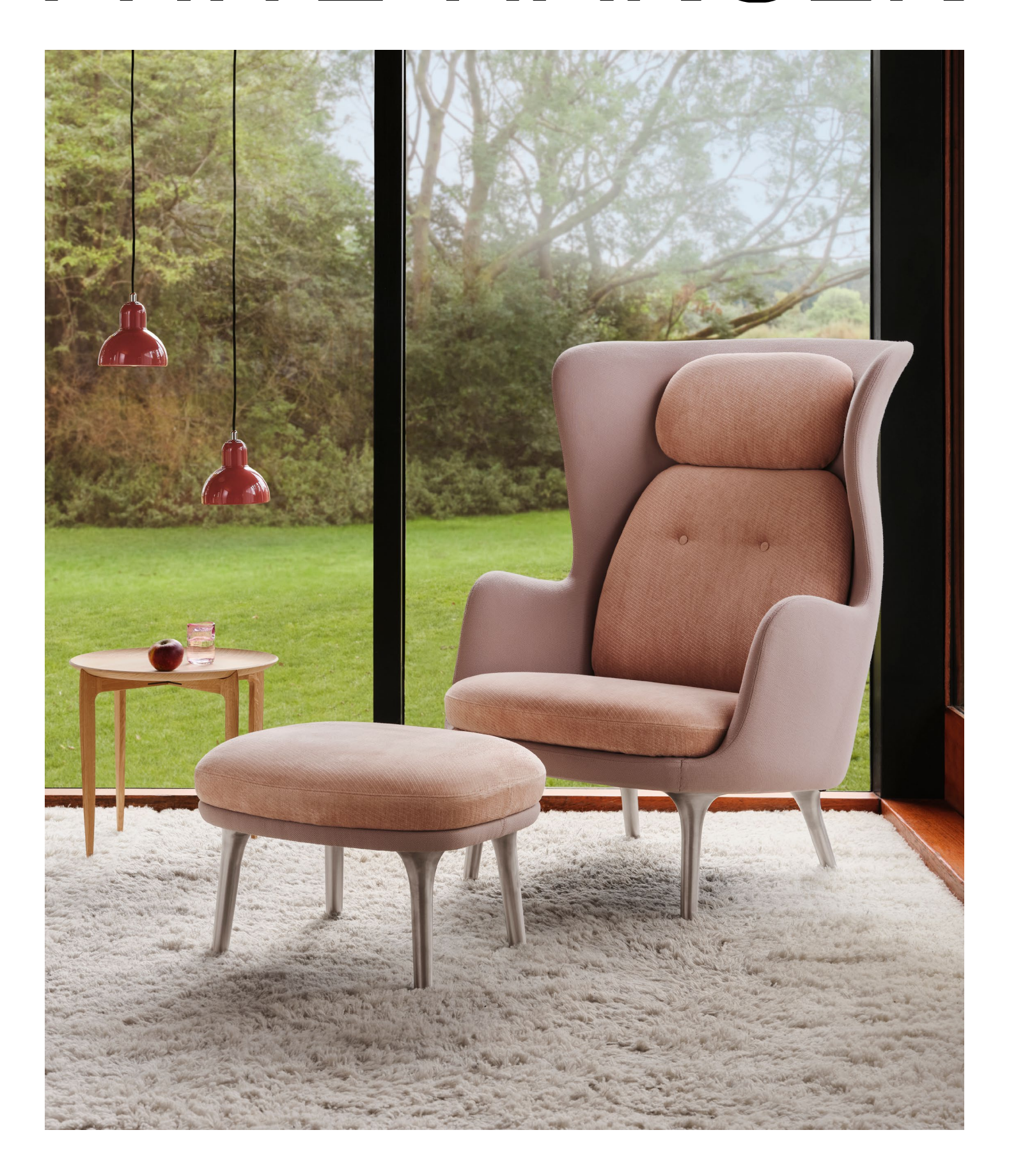
RO™ - DESIGNER SELECTION PRODUCT FACT SHEET